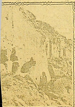
F. BANDELIER NATIONAL EXTENDING FOR MORE THAN HALF A MILE ALONG THE CANYON