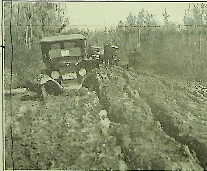
THE KIND WE DON'T WANT.

Next month the year book should be ready.