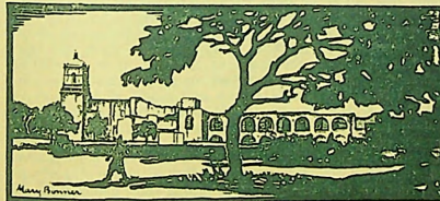
MISSION SAN JOSE, SAN ANTONIO

It was occupied by the Texas patriots in defense of San Antonio and for the independence of Texas against Santa Ana and the Mexican army. The Alamo fell March 6, 1836. All the patriots were killed. The defense of the Alamo is one of the epic stories of the ages. (See page 21.)