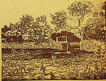
DAM OF THE MISSION IRRIGATING SYSTEM, SAN DIEGO THE MOTHER MISSION OF CALIFORNIA, SAN DIEGO DE ALCALA.

"Old Conquistadores, Oh brown priests and all, Give us your ghosts for company as night begins to fall; There's many a road to travel, but it's this road today, With the breath of God about us on the King's Highway."