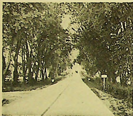
Comfort above and below: a concrete road beneath a canopy of leaves.

difficulties presented by topography, unusually narrow or wide rights-of-way, or special drainage requirements, may cause deviation from an adopted standard. In the main, however, the planting regulations will be followed, and the desired end will be accomplished.