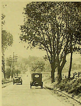
Trees must be far enough from the edge of the pavement to permit adequate drainage, and to allow future widening of the road if increased traffic makes it necessary.

In grouping trees the same species should be used, as a rule; that is, maples in a group, oaks in a group, etc. It is advisable to reproduce, so far as possible, the native growth of the district. If the road passes through an oak grove, carry the oak planting further into the open before planting another species.