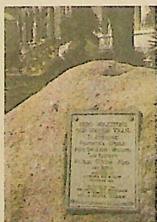
CITY CENTER 100 S. Flores St. @ City Hall San Antonio

1920s Old Spanish Trail Association Directors suggested cities and counties place 0-mile stones at the city center, decorative OST monuments to mark city limits, county lines, and state borders. Restorations of these OST markers are beginning in San Antonio and Bexar County, Texas.