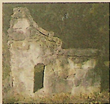
COUNTY LINE 29324 Boerne Stage Rd. @ Balcone Creek Bexar/ Kendall County Line