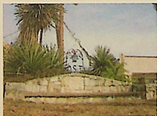
CITY LIMITS 3400 Fredericksburg Rd. @ Vance Jackson San Antonio