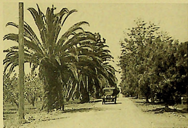
Roadsides in the Gulf states and California have their distinctive plantings of palms or pepper trees.

For the sake of beauty it is better to leave trees untrimmed; let them take their natural shape, and not "head" them or "trim them up" as many inexperienced tree trimmers want to do. A good rule is to trim out only dead or unhealthy branches.