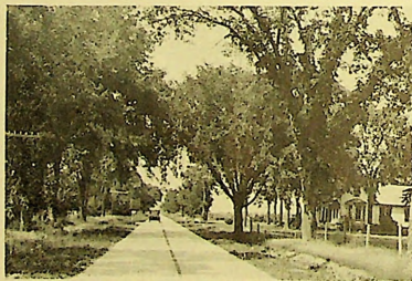
Years ago some far-sighted man planted these elms.

A proper planting of healthy stock assures higher resistance to future attacks by pests or drought.