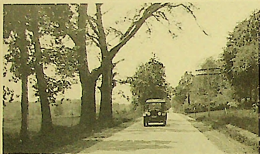
Oaks, such as these, bordering the even concrete add to the traveler's delight and comfort.

In placing stakes directly in front of buildings immediately adjacent to the highway, the consent of the owner should be obtained.