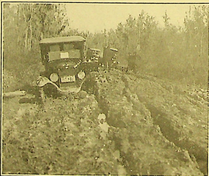
THE KIND WE DON'T WANT.

Next month the year book should be ready.