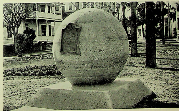
Old Spanish Trail Zero Marker, placed by the St. Augustine Exchange Club, marking the beginning of the Old Spanish Trail reaching from this city to San Diego, California.