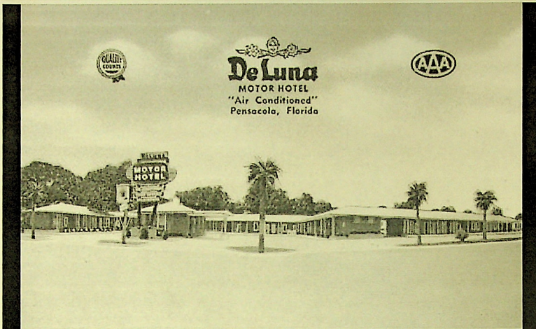
The De Luna was located at 801 W. Cervantes St. (US 90) Pensacola